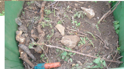
Unacceptable amount of soil

A large amount of turf is also unacceptable. If there are a few offcuts and the bin isn't too heavy to move, the bin can be collected