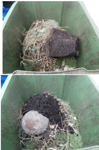
Acceptable amounts of soil

The images should give you a guide to how much soil is acceptable.