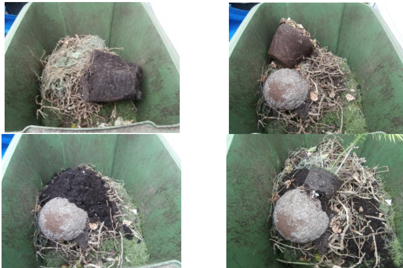
Acceptable amounts of soil

The images should give you a guide to how much soil is acceptable.