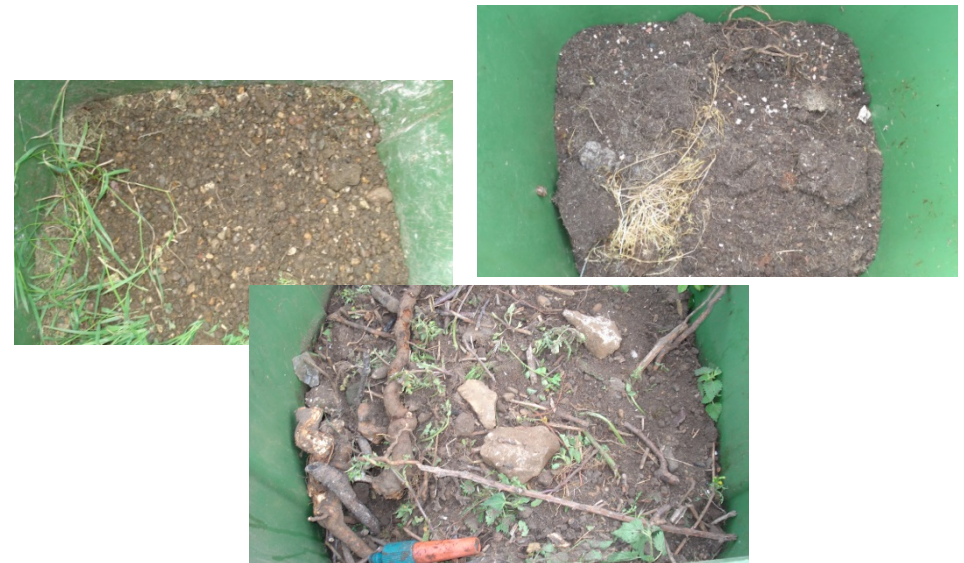
Unacceptable amount of soil

A large amount of turf is also unacceptable. If there are a few offcuts and the bin isn't too heavy to move, the bin can be collected