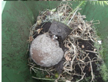
Acceptable amounts of soil