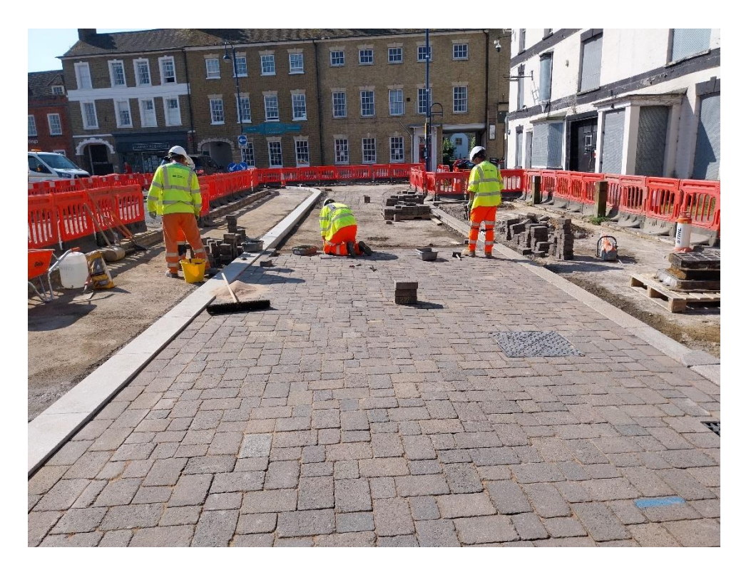
26/06/24 – Relaying of Market Place continues. New kerb line installed (left) to expand Market Square and loading bay (right) has been lifted and will be re-laid soon.